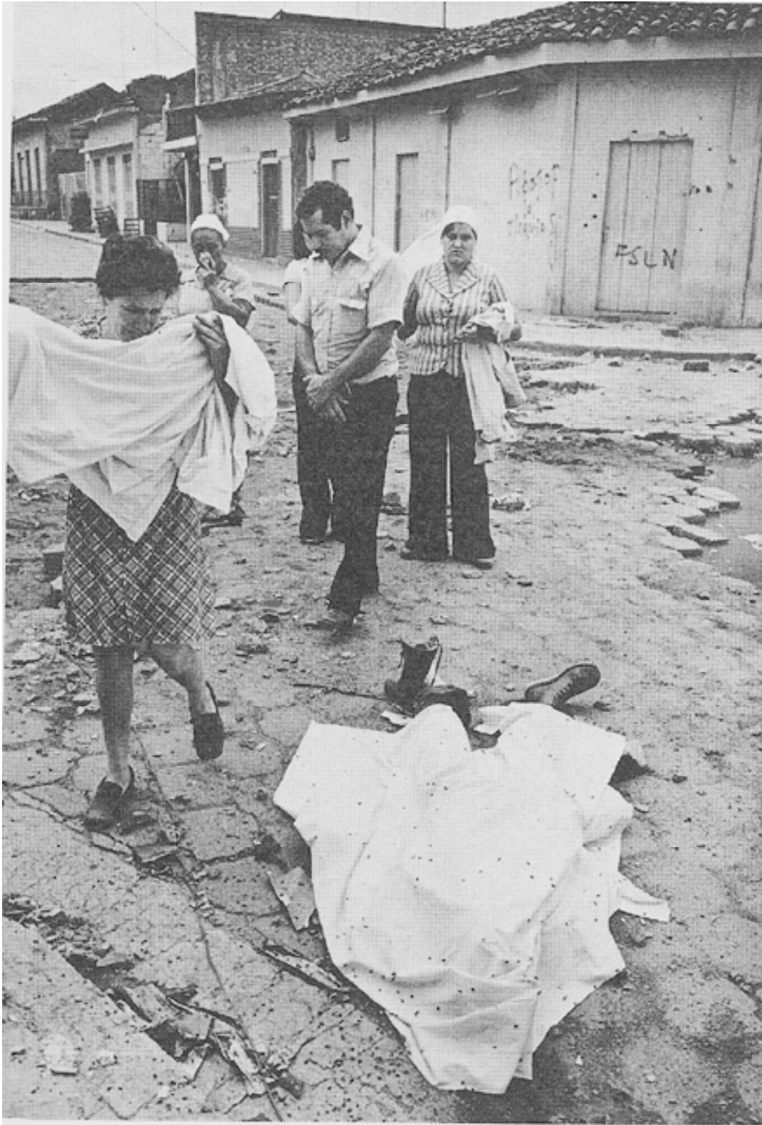
NICARAGUA, 1979

"...the sheet carried by the weeping mother (why this sheet?)..."